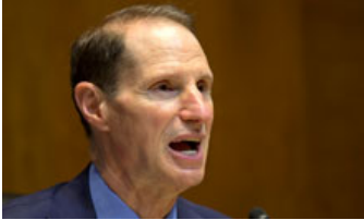
Senator Ron Wyden.

The document – which is undated, though metadata suggests this version was last updated in June 2012 – does not say whether the oversight process it mentions has been established or whether any searches against US person names have taken place.